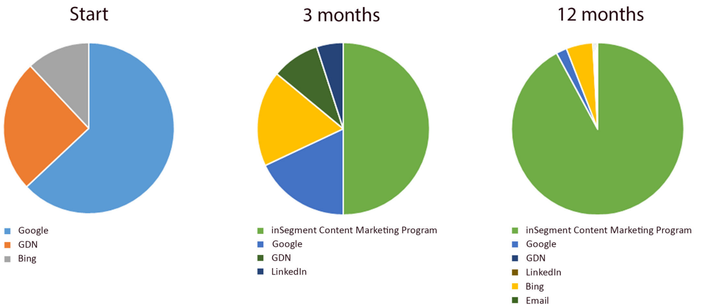
Cost per Sales-Qualified Lead (12 months)